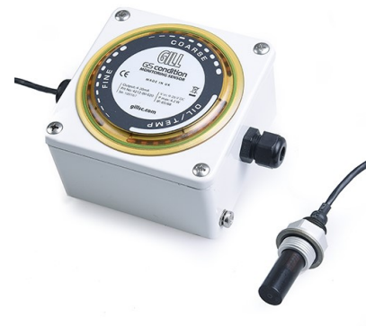
Sensor with display electronics