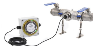
Optional In-flow adaptor