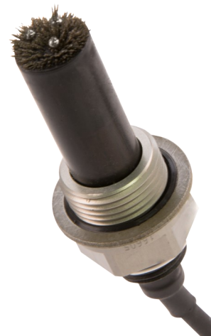
Sensor with debris attached