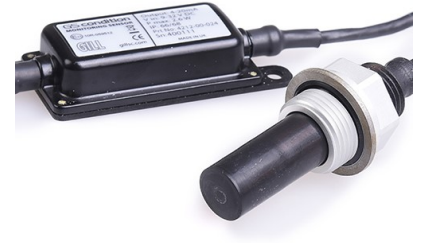
Sensor & electronics