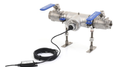
Optional In-flow adaptor